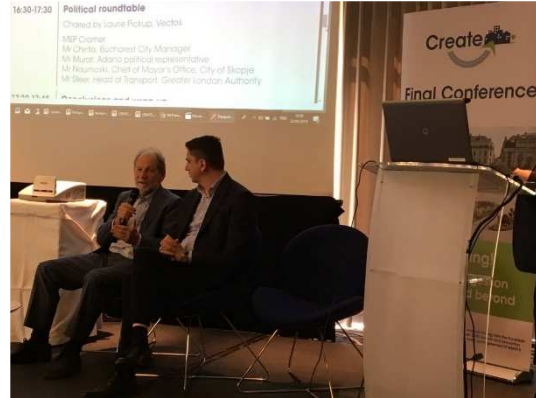
MEP Cramer, Greens, Germany